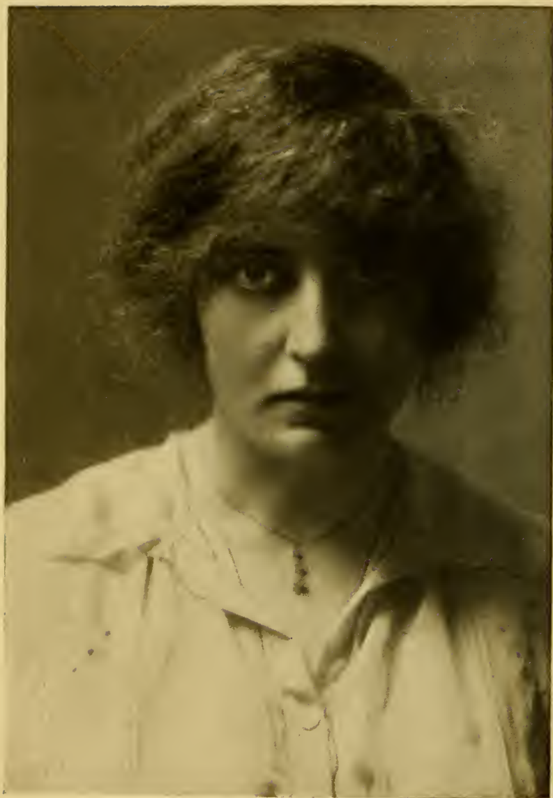
Mary Mac Lane.